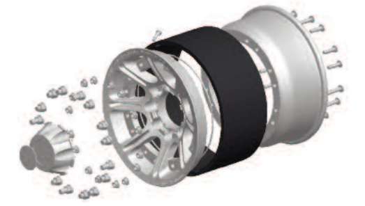
Exploded view Rock Monster® wheel assembly